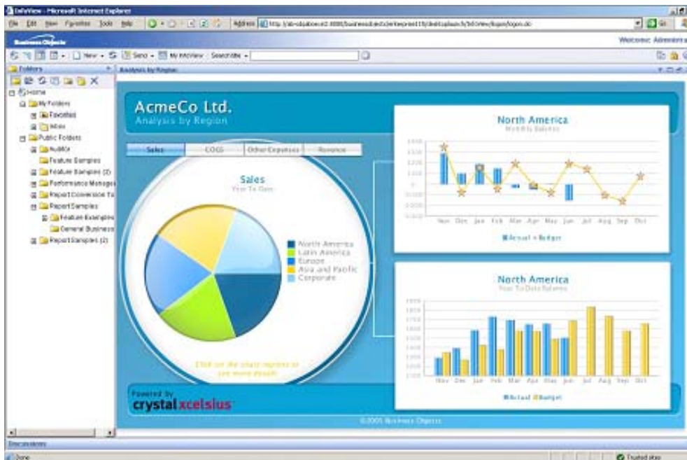
Figure 2: The Business Objects InfoView portal Includes an Intuitive End-User Web Interface